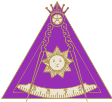
Sutton Lodge of Perfection

in the Valley of Salem, Massachusetts Northern Masonic Jurisdiction, U.S.A.