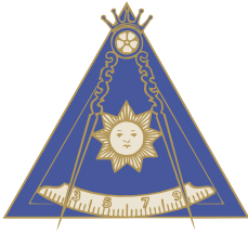
Sutton Lodge of Perfection

Valley of Salem, Massachusetts Northern Masonic Jurisdiction, U.S.A.