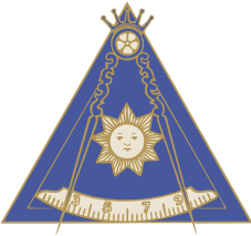
Sutton Lodge of Perfection

Valley of Salem, Massachusetts Northern Masonic Jurisdiction, U.S.A.