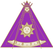
Sutton Lodge of Perfection

in the Valley of Salem, Massachusetts Northern Masonic Jurisdiction, U.S.A.