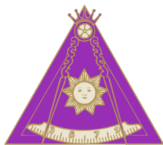
Sutton Lodge of Perfection

in the Valley of Salem, Massachusetts Northern Masonic Jurisdiction, U.S.A.